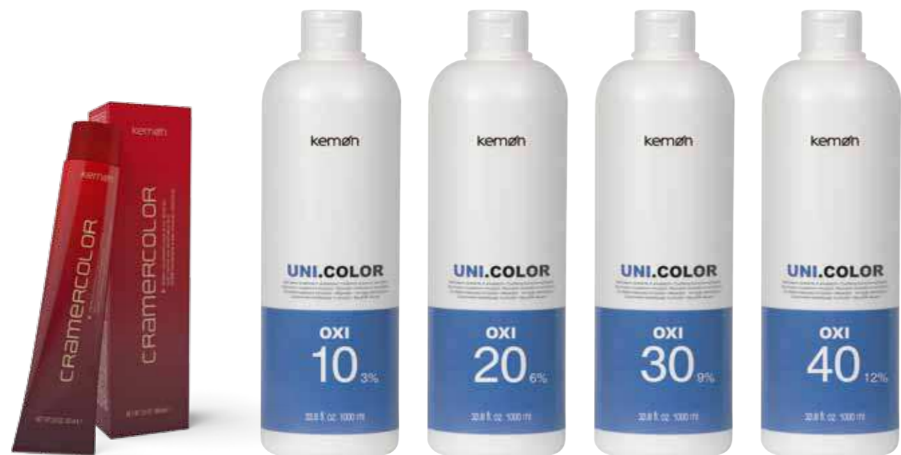
100 ml tube

It is easy to mix, apply, rinse and remove.